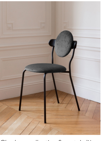
Charbon, collection Smart, Lelièvre