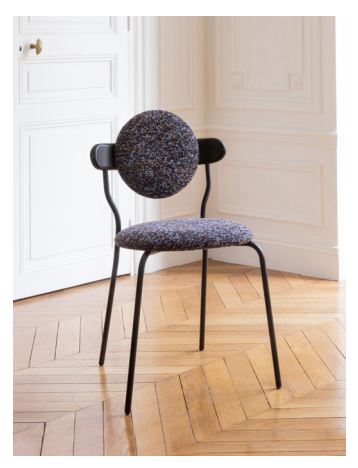
Atom, Raf Simons, Pierre Frey Cat. 5