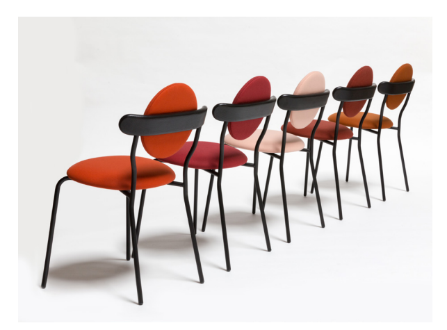
Shades of red, Tipi, Pierre Frey Cat. 2