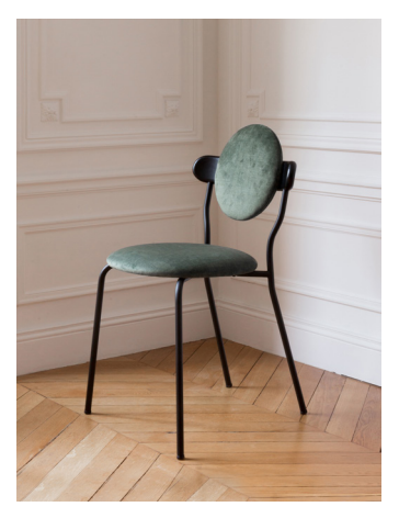
Pin, collection Smart, Lelièvre