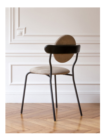
Gingembre , Daim, Lelièvre Cat. 2