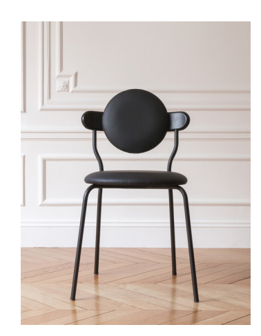
Black faux leather